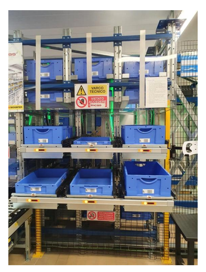
Figure E.3. Picking station with pick-to-light system.

In the year 2021, the simulation model built previously was integrated with the real operational parameters of the AS/RS, namely the speed and acceleration of the machine.