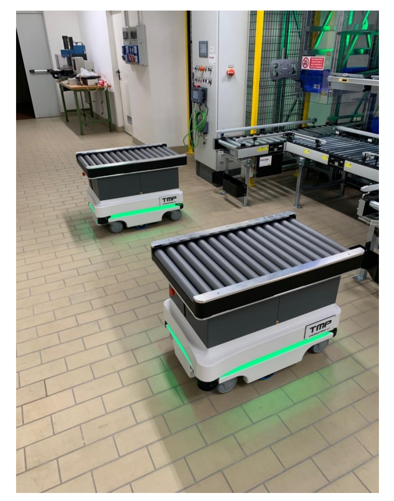
Figure E.1. The two AGVs connected to the AS/RS.

INCAS S.p.A. As a matter of fact, the chosen layout (see Figure E.2) combines four operations within the same installation, namely order picking, kitting, put-away and outbound. A pick-to-light system completes the AS/RS, whereby loading units are moved to the gravity flow racks for picking and kitting operations and a display shows the number of products to be picked by the operator from each loading unit (see Figure E.3).