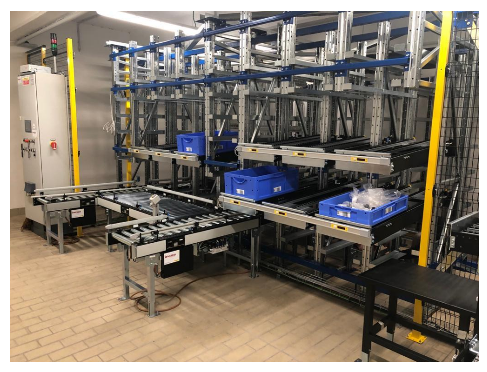
Figure E.2. The AS/RS with the two working stations.